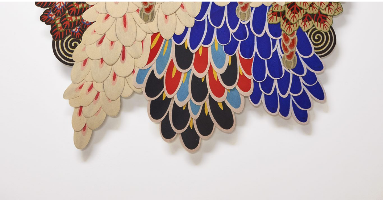
Image: Mayumi Lake, (Unison) Despair, 2021. Multi-colored pigment on canvas of flowers and leaves hanging together in the shape of a teardrop.

SY: My process is a little different. I start with the accumulated mark or material, and then I let go. Whatever the accumulation does, I cannot always predict or control. I don't know that I set out to make a document, and yet I end up with this sculptural byproduct in the end. I have a regular practice of taking photographs of masks on the ground and all the jigsaw puzzles I complete. But I think about my photographs more as a collecting habit rather than a documenting habit. I don't see taking those pictures as different from accumulating the metal can tabs or using cross-stitch as a way to collect moments that are quickly passing out of existence. It is another way to pay attention, and to point to the human urge to hold onto something fleeting.