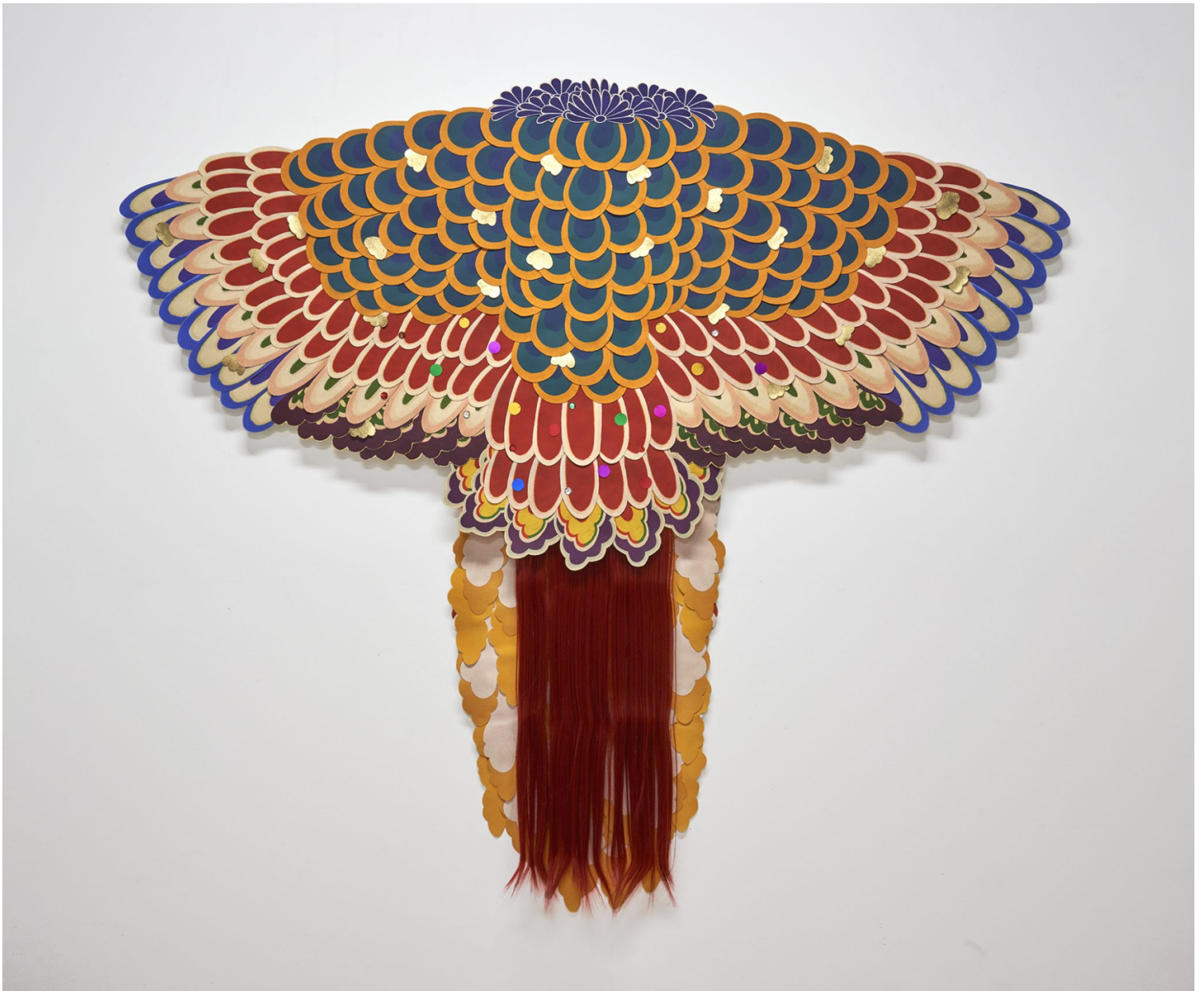
Image: Mayumi Lake, (Unison) Resonance, Pigment print on canvas, gold leaf, sequins, synthetic hair, and wood, 58 x 55 x 1.5 inches, 2021.

Given the format of the show, I decided to speak to the artists in tandem.