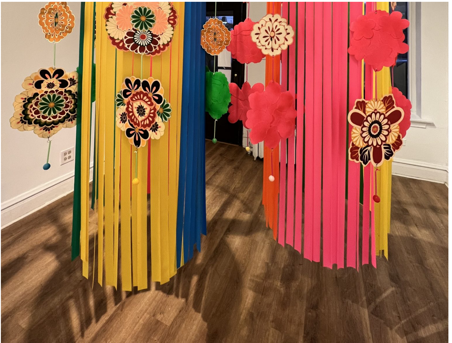
Image: Mayumi Lake, (Unison) Pink & Green Kaleidoscope , Pigment print on canvas, acrylic paint, PVC tape, metal, chain, ribbon, plastic, thread, each 84 x 24 x 24 inches, 2021. Two-embroidered hanging sculptures, with two layers hung on inner and outer circles. The outer circles has embroidered flowers and around the smaller inner are pieces of frayed fabric.

ML: For me, it's about the moment. I don't think about freezing time as much as defrosting a frozen time. I'm drawing from 1200 years ago, people's habits and fears, and digesting it in a contemporary way. I'm interested in everything old and historical. I grew up in between Kyoto and Osaka, so everything was historical in one, and modern in the other. I felt the pull between the two. I initiated this project from the ideas of the historical, bringing back a historical symbol using digital photo techniques, so I feel in between times. The irony of the housouge is to show ancient fear, and yet here we are in 2022 and we still feel that ancient fear in a different timeline.